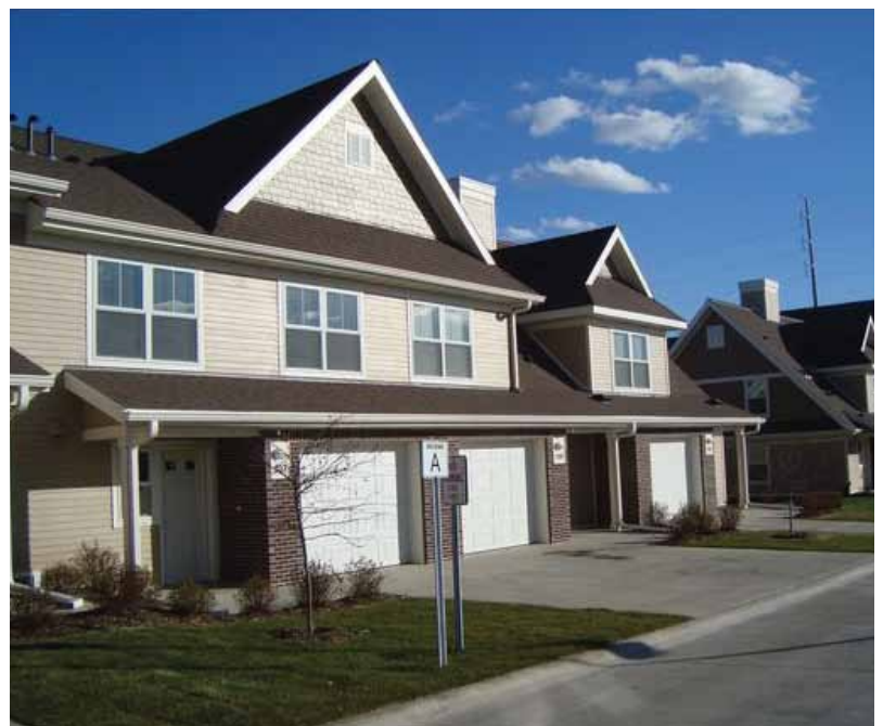
Unity Square—Waterloo, IA opens its doors

The development, located at 100 Unity Square in Waterloo, converts an underutilized three-acre parcel of land to 40 high-quality, large family townhomes with comprehensive service programs. The housing and on-site Mercy Advantage Center will provide stability for working families and their children so they can maintain employment, advance their education, and increase the economic vitality of their families while adding to the vibrancy of the surrounding neighborhood. •